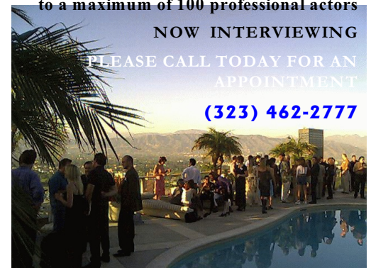
APS Event - Myron Estate - 98 Producers - 46 Actors